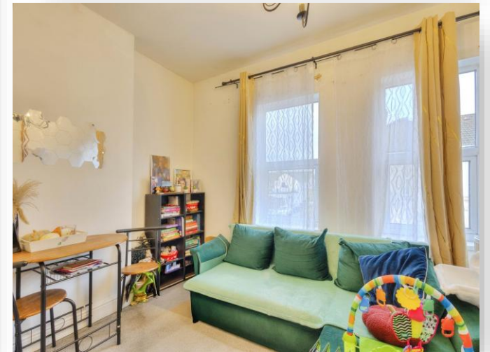
Euston Road, Northampton NN4 8DT