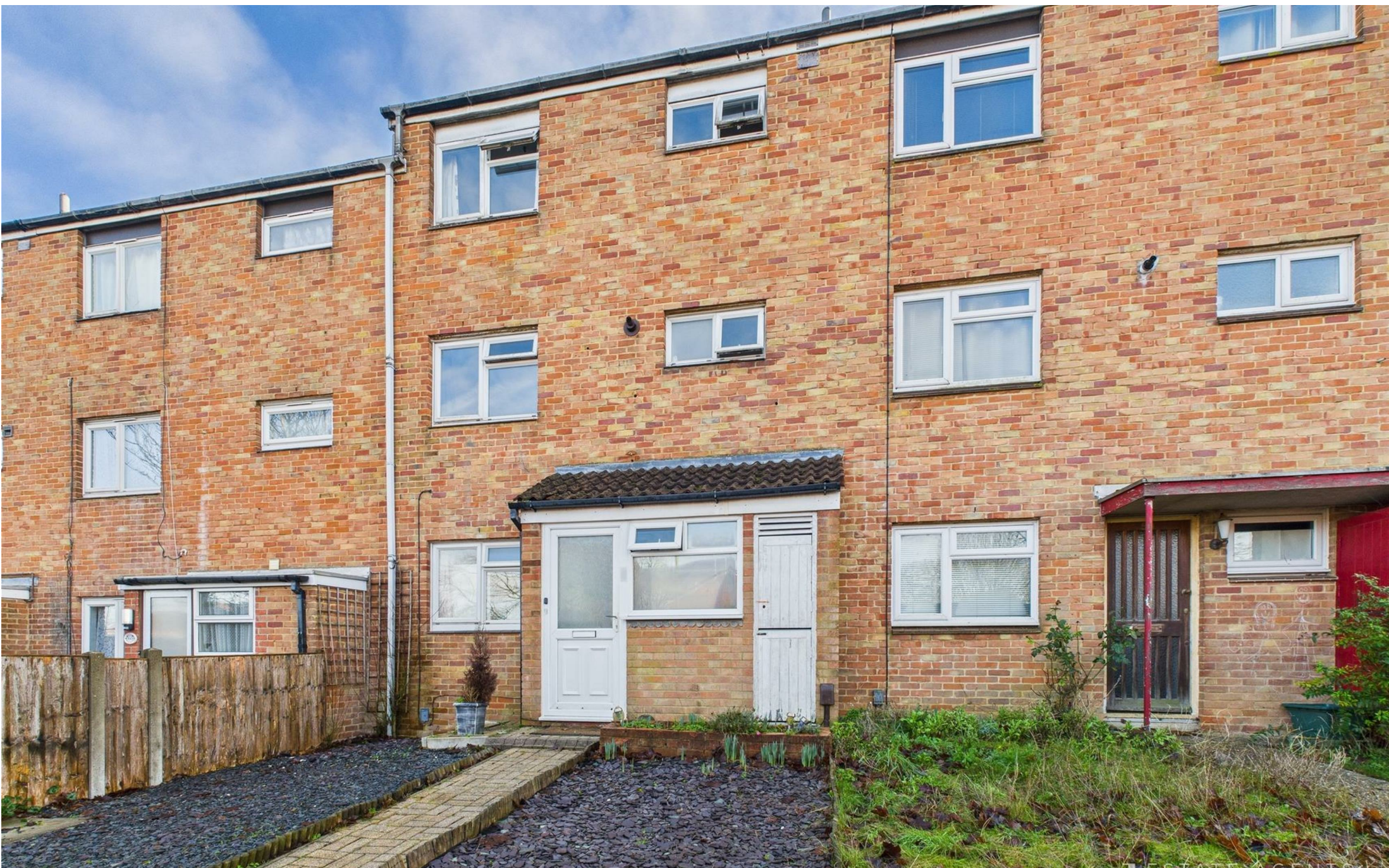
Lehar Close, Brighton Hill, Basingstoke, RG22 4HT