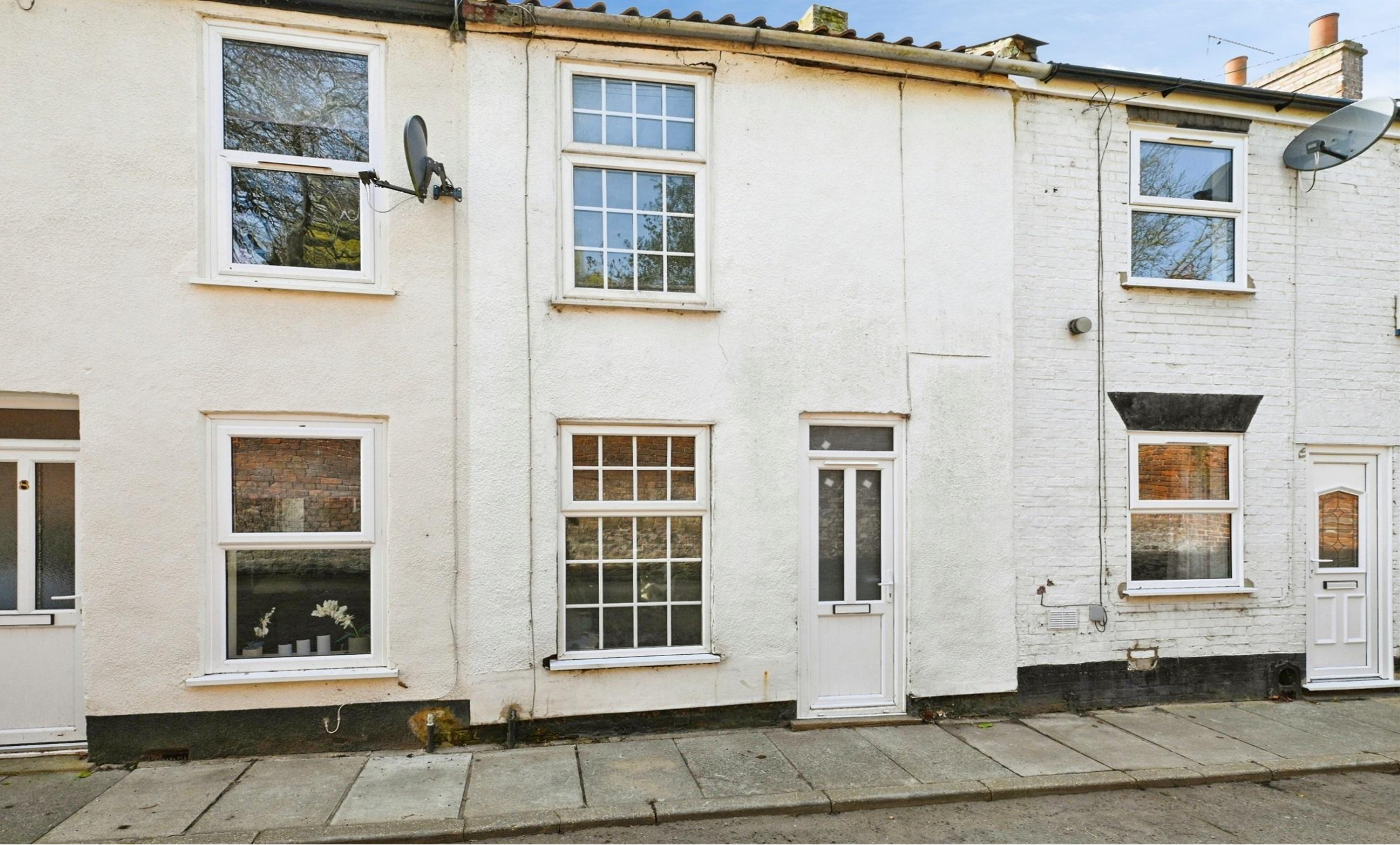
Thomas Street, King's Lynn, PE30 5QP