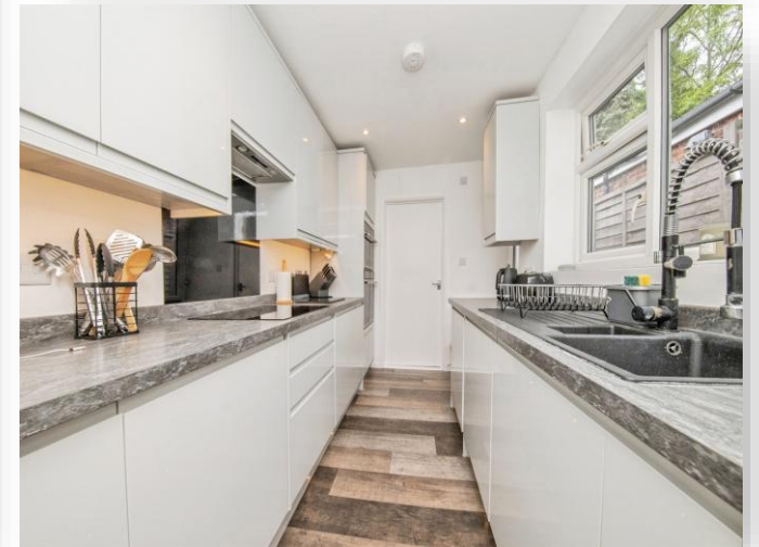
Sproughton Road, Ipswich, IP1 5AB