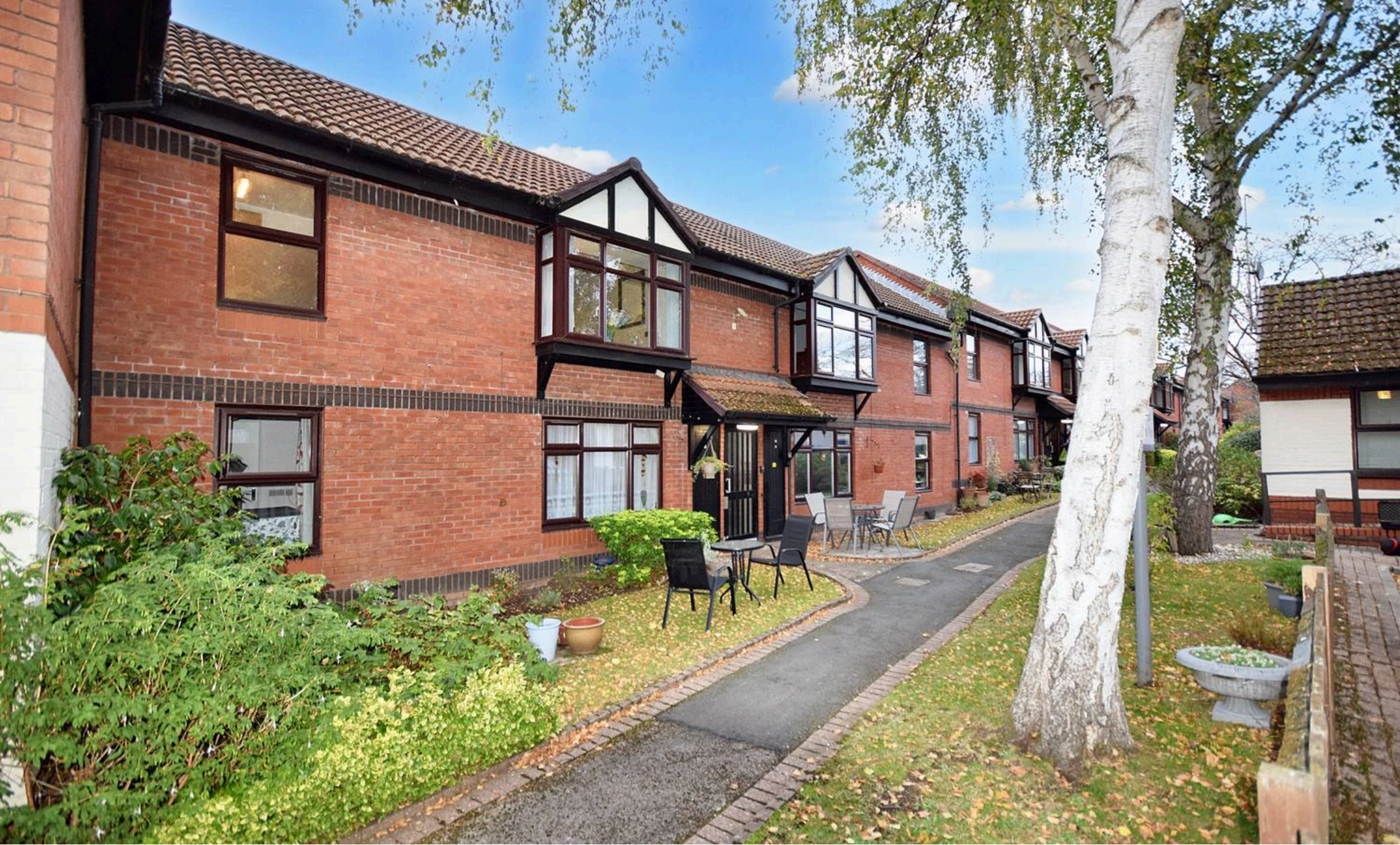
4 Prospect Place, Epsom Epsom