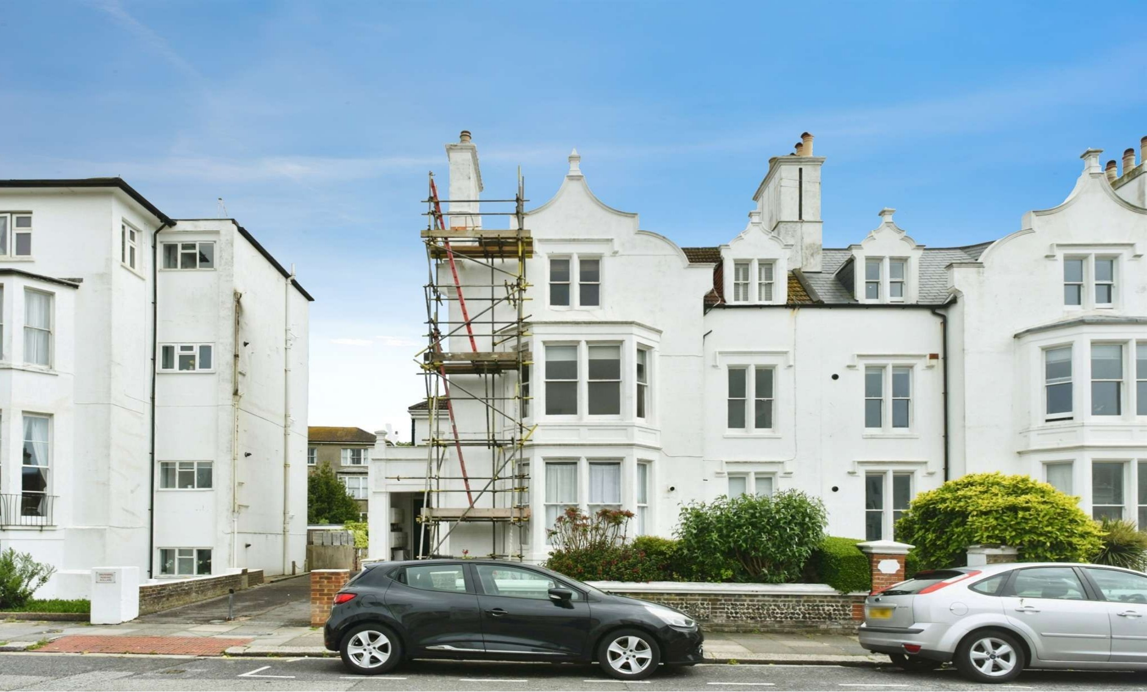
Medina Villas, Hove BN3 2RP