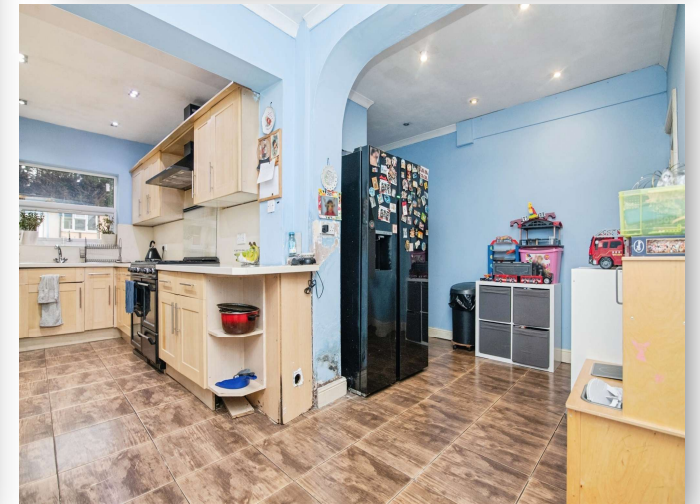
Coopers Road, Handsworth Wood Birmingham B20 2JU