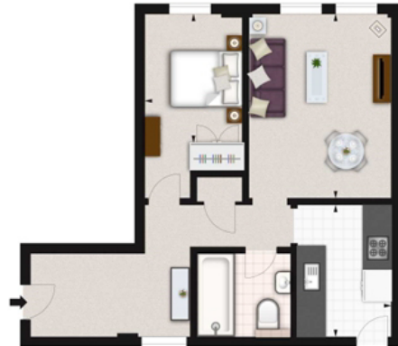
ILLUSTRATION FOR IDENTIFICATION PURPOSES ONLY, NOT TO SCALE * As Defined by RICS - Code of Measuring Practice

APPROX. GROSS INTERNAL AREA * 462 Ft 2 - 42.92 M 2