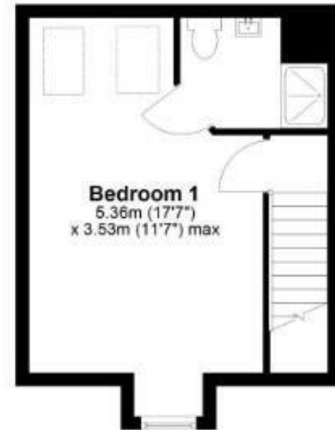
Second Floor Approx. 24.8 sq. metres (267.0 sq. feet)

Disclaimer These particulars, whilst believed to be accurate are set out as a general outline only for guidance and do not constitute any part of an offer or contract. Intending purchasers should not rely on them as statements of representation of fact, but must satisfy themselves by inspection or otherwise as to their accuracy. No person in this firm's employment has the authority to make or give any representation or warranty in respect of the property. All measurements and distances are approximate only. Your home is at risk if you do not keep up repayments on a mortgage or other loan secured on it.