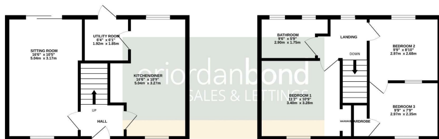
TOTAL FLOOR AREA : 813 sq.ft. (75.5 sq.m.) approx.

Whilst every attempt has been made to ensure the accuracy of the floorplan contained here, measurements of doors, windows, rooms and any other items are approximate and no responsibility is taken for any error, omission or mis-statement. This plan is for illustrative purposes only and should be used as such by any prospective purchaser. The services, systems and appliances shown have not been tested and no guarantee as to their operability or efficiency can be given. Made with Metrepro C10025