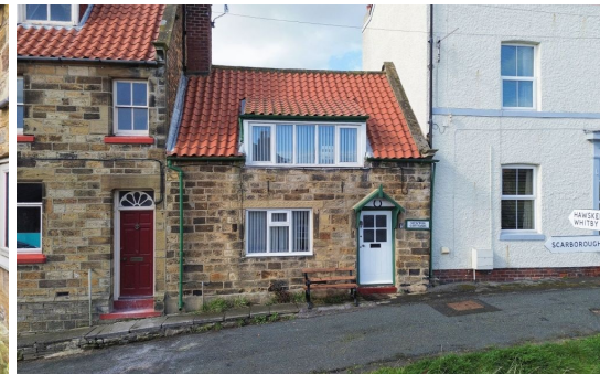
NEWTON COTTAGE, FYLINGTHORPE- 2 bed Cottage -£239,500