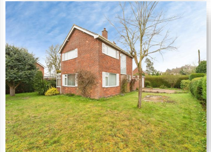
Enfin Mill Street, Elsing Dereham NR20 3EH