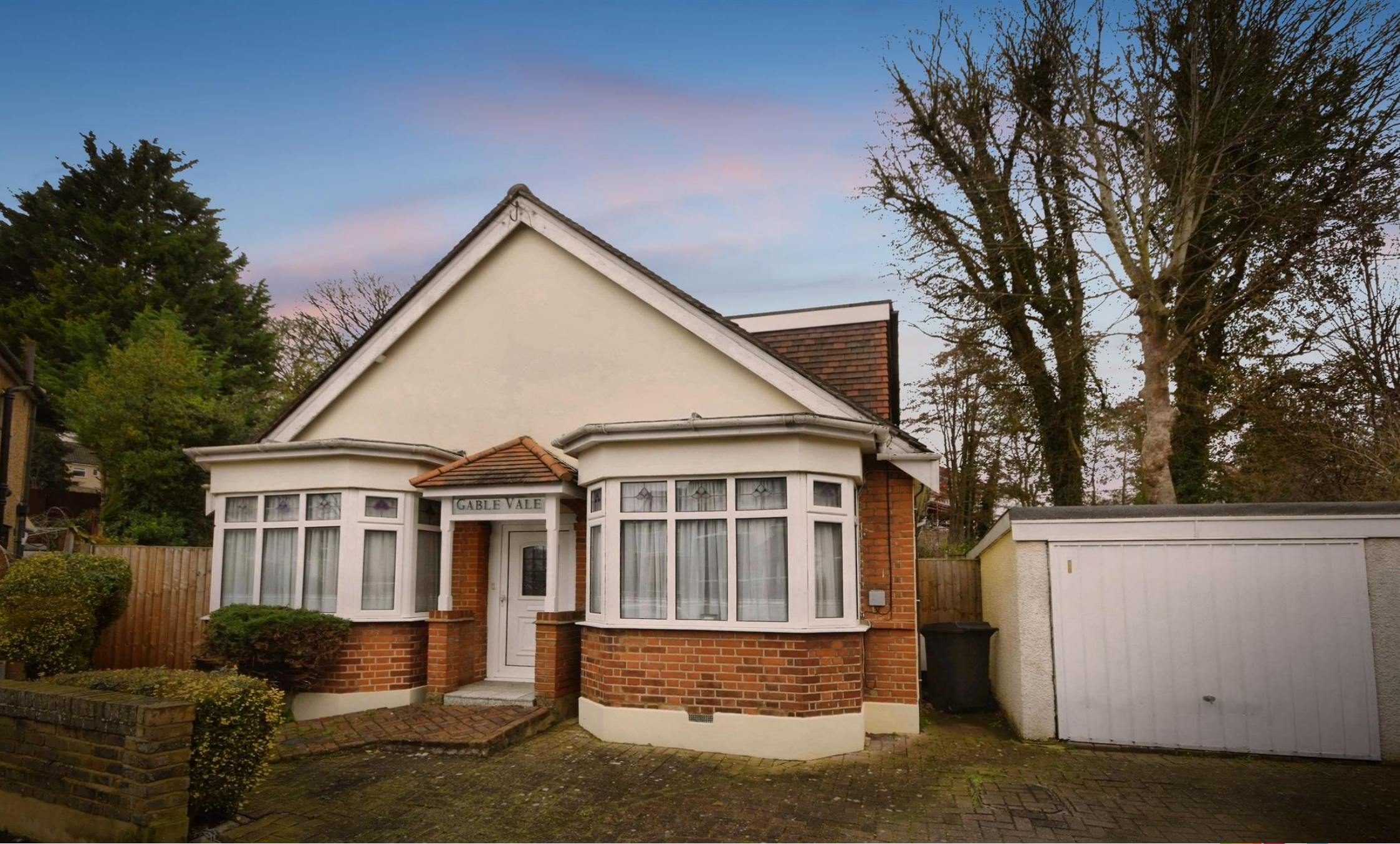
Gable Vale, The Close, Rose Valley, Brentwood, CM14 4JA