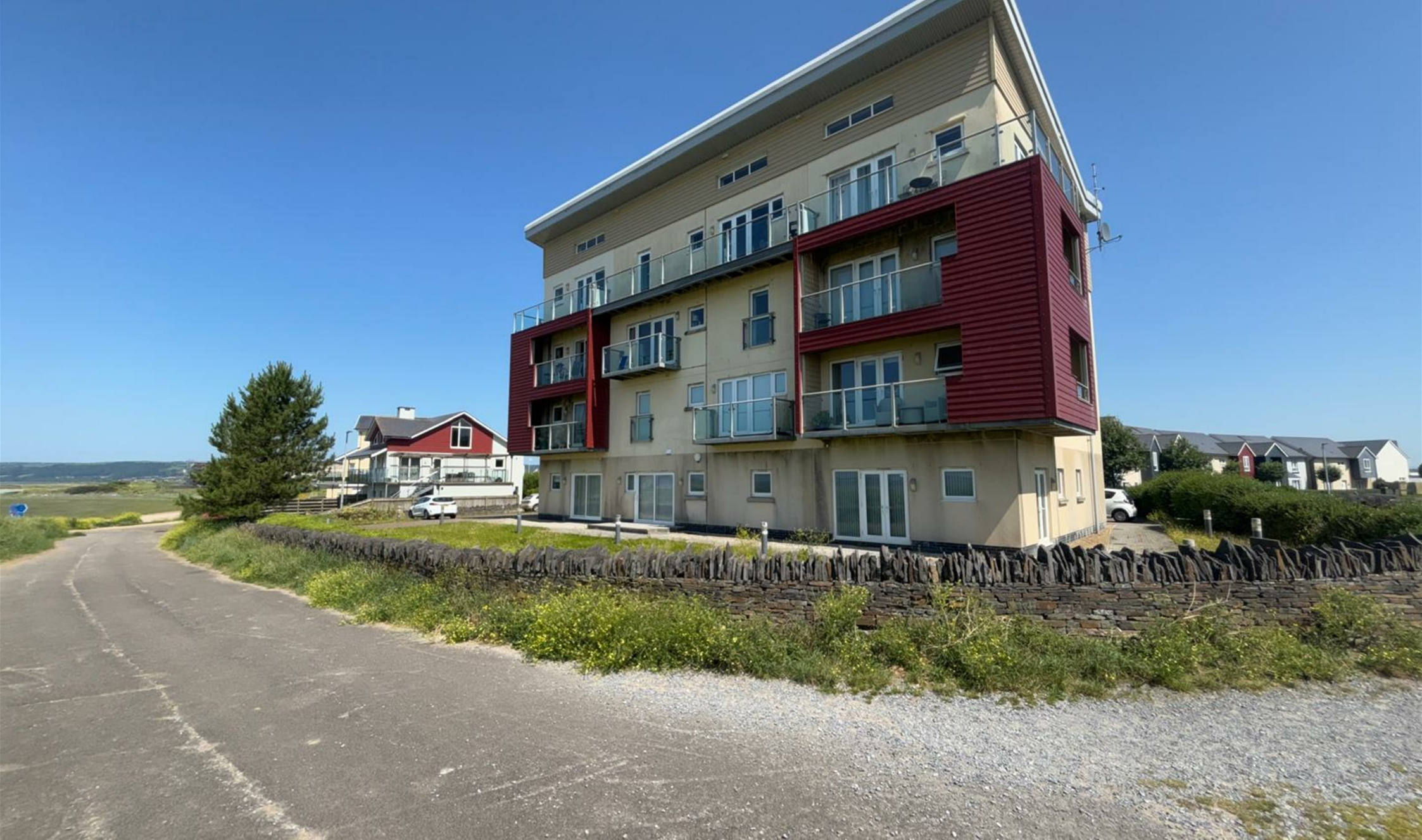
The Penthouse, 12 Bay View Bwlchygwynt, Llanelli, SA15 2GB £218,000