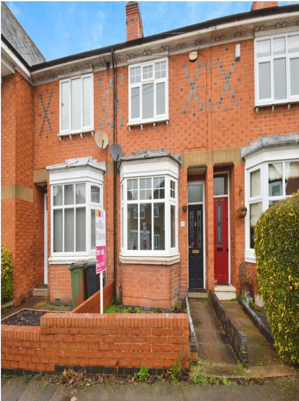
Stoughton Road, Oadby Leicester LE2 4DS