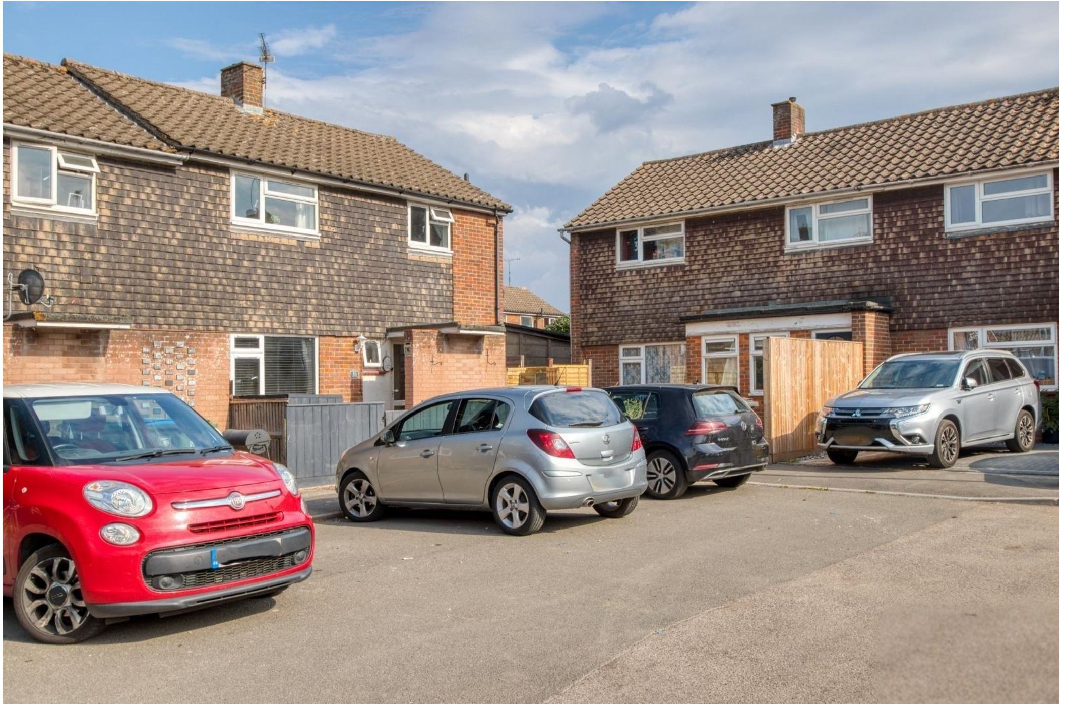
EIGHT ACRES TRING HERTFORDSHIRE HP23 5DB