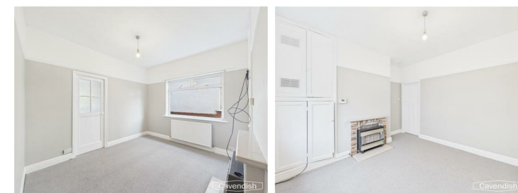
A comfortable second reception room with an electric fire set in a tiled surround and hearth, radiator, built-in alcove cupboards with shelving, and a double-glazed window to the side. The gas central heating boiler is located here, along with a part-glazed door leading through to the kitchen.