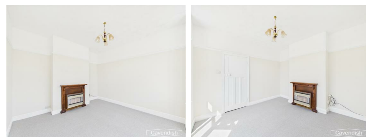
A generous front-facing room featuring a wooden fire surround with electric fire, and a large double-glazed bay window. Could be used as a third bedroom also.