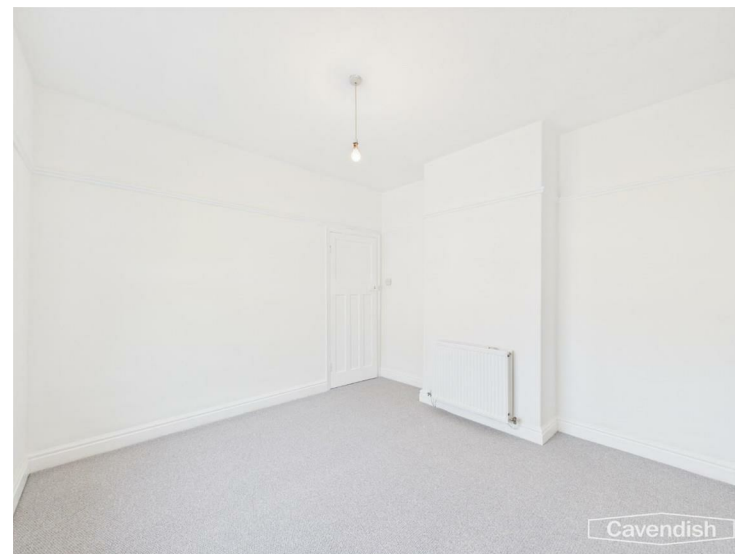
Good-sized rear bedroom with radiator and double-glazed window.