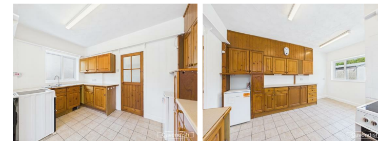
Well-equipped kitchen with a range of base and wall units, ample work surfaces, stainless steel sink with mixer tap, and space for a freestanding cooker, fridge, and freezer. There is plenty of room for a dining table, with tiled flooring and double-glazed windows overlooking the side and rear.