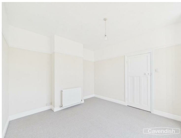
Spacious front bedroom with double-glazed bay window and radiator.