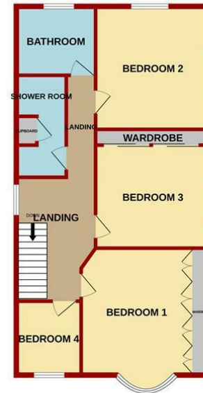
TOTAL FLOOR AREA: 1956 sq.ft. (181.7 sq.m.) approx. Measurements are approximate. Not to scale. Illustrative purposes only. Made with Metropix ©2025