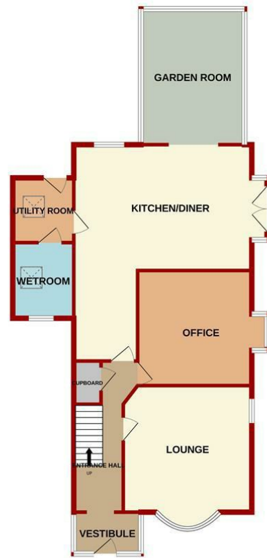
GROUND FLOOR 1106 sq.ft. (102.7 sq.m.) approx.