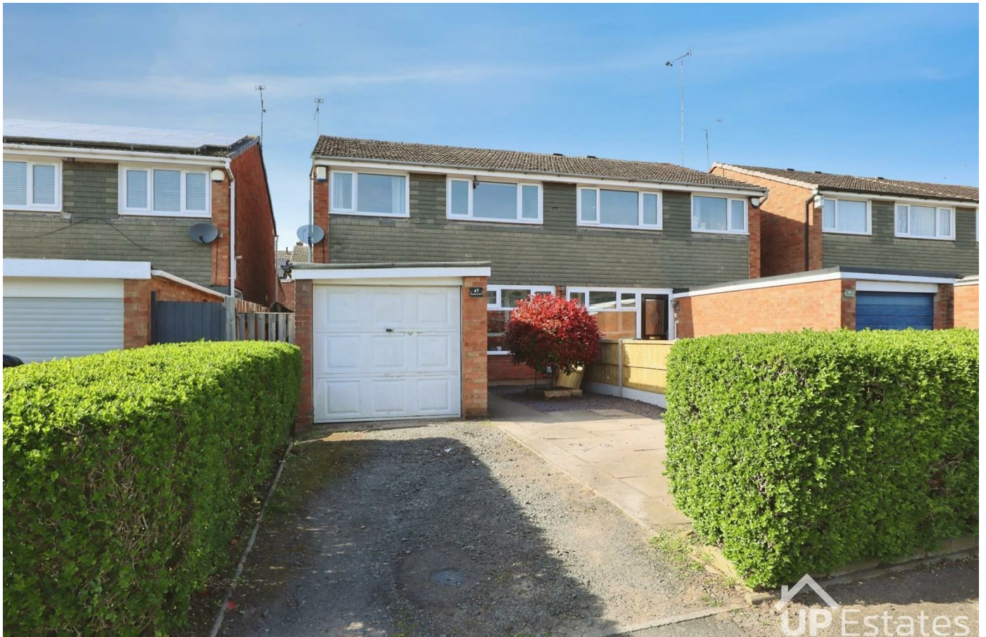
Mayflower Drive, Coventry