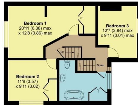
FIRST FLOOR APPROX FLOOR AREA 59 SQ M (635 SQ FT)