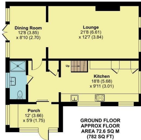
GROUND FLOOR APPROX FLOOR AREA 72.6 SQ M (782 SQ FT)