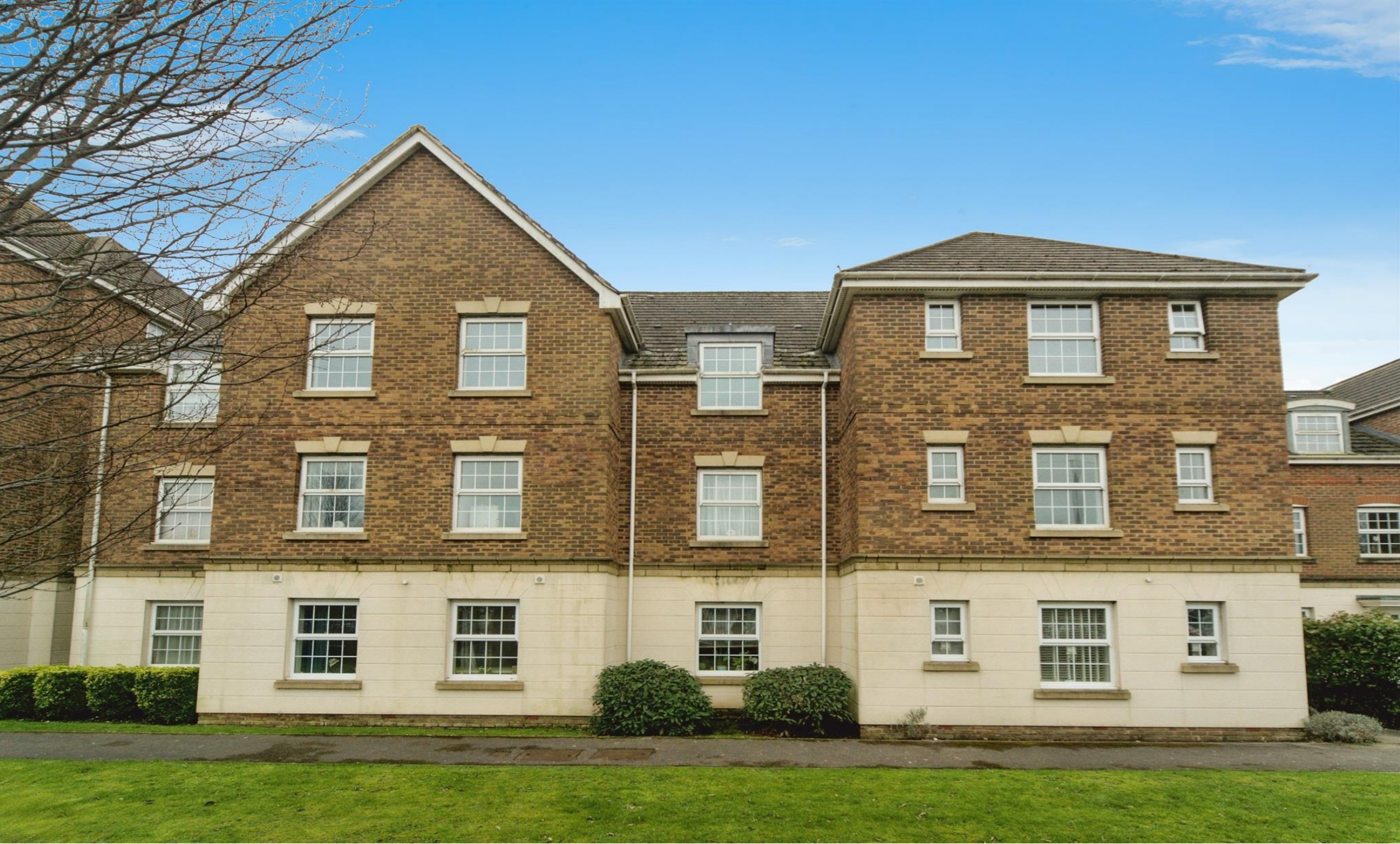
Teachers House - Scholars Walk, Bexhill-On-Sea TN39 5GB