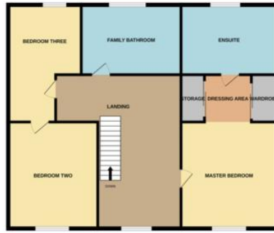
1ST FLOOR 1176 sq.ft. (109.3 sq.m.) approx.