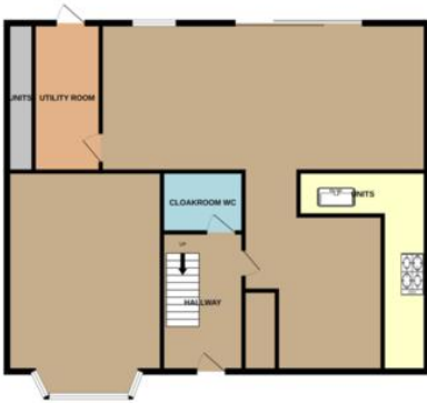
GROUND FLOOR 1195 sq.ft. (111.0 sq.m.) approx.