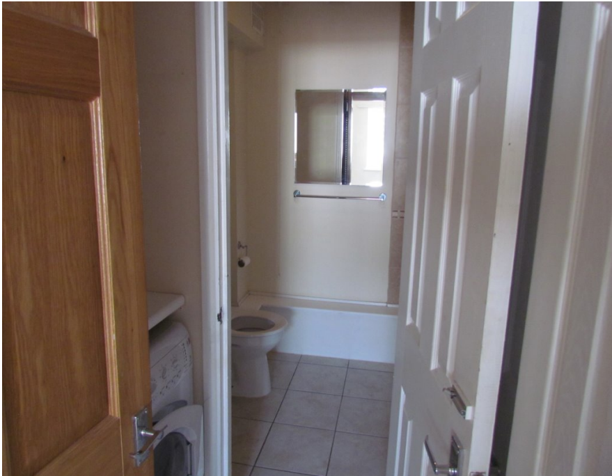
Dashwood Avenue, High Wycombe, HP12 3EB Total Area: 36.5 m 2 ... 393 ft 2 (excluding store, entrance hall)