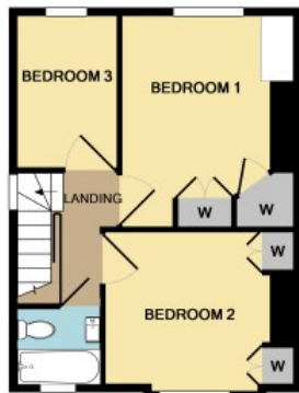
1ST FLOOR APPROX. FLOOR AREA 329 SQ.FT. (30.6 SQ.M.)

TOTAL APPROX. FLOOR AREA 902 SQ.FT. (83.7 SQ.M.) Whilst every attempt has been made to ensure the accuracy of the floor plan contained here, measurements of doors, windows, rooms and any other items are approximate and no responsibility is taken for any error, omission, or mis-statement. This plan is for illustrative purposes only and should be used as such by any prospective purchaser. The services, systems and appliances shown have not been tested and no guarantee as to their operability or efficiency can be given Made with Metropix ©2015