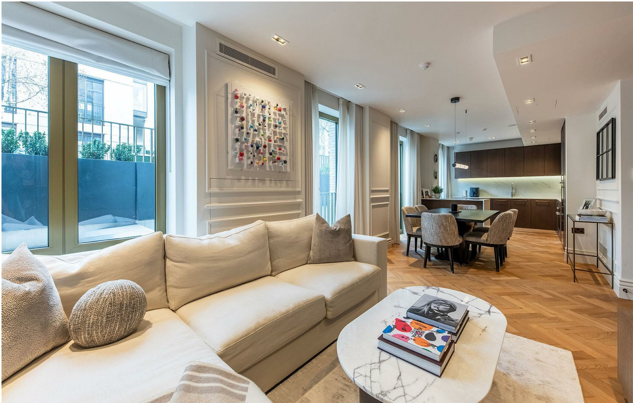
St Edmunds Terrace, St Johns Wood London NW8 7ET Asking price £1,950,000 Leasehold