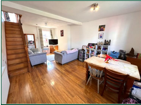
GROUND FLOOR 343 sq.ft. (31.9 sq.m.) approx.