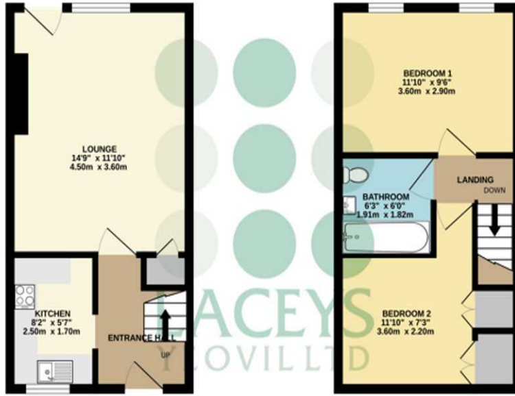
TOTAL FLOOR AREA: 566sq.ft. (52.8 sq.m.) approx.

Whilst every attempt has been made to ensure the accuracy of the floorplans contained here, measurements of doors, windows, rooms and any other items are approximate and no responsibility is taken for any error, omission or mis-statement. This plan is for illustrative purposes only and should be used as such for any prospective purchaser. The services, systems and appliances shown have not been tested and no guarantee is given as to their operability or efficiency nor to the green. Made with Intertek iQ226