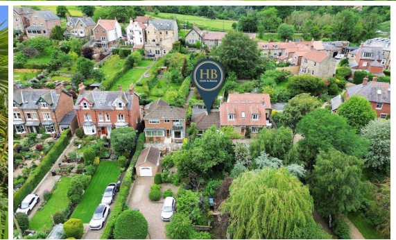
75 LOWDALE LANE, SLEIGHTS- 2 bed Semi-Detached Bungalow -£165,000