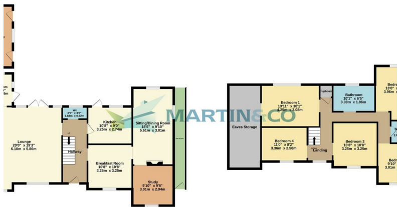
1st Floor 956 sq.ft. (88.8 sq.m.) approx.

TOTAL FLOOR AREA: 2080 sq.ft. (193.2 sq.m.) approx. Whilst every attempt has been made to ensure the accuracy of the floorplan contained here, measurements of doors, windows, rooms and any other items are approximate and no responsibility is taken for any error, omission or mis-statement. This plan is for illustrative purposes only and should be used as such by any prospective purchaser. The services, systems and appliances shown have not been tested and no guarantee as to their operability or efficiency can be given. Made with Metropix i2025