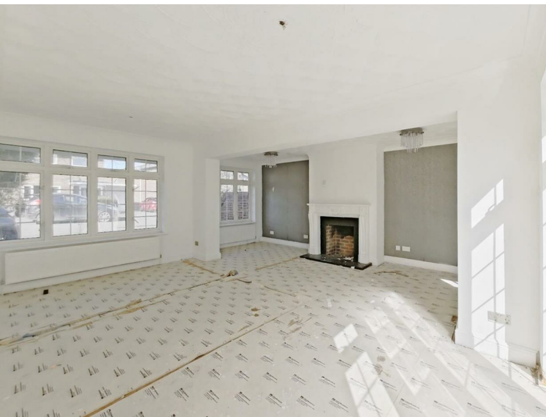
Ground Floor 1124 sq.ft. (104.4 sq.m.) approx.