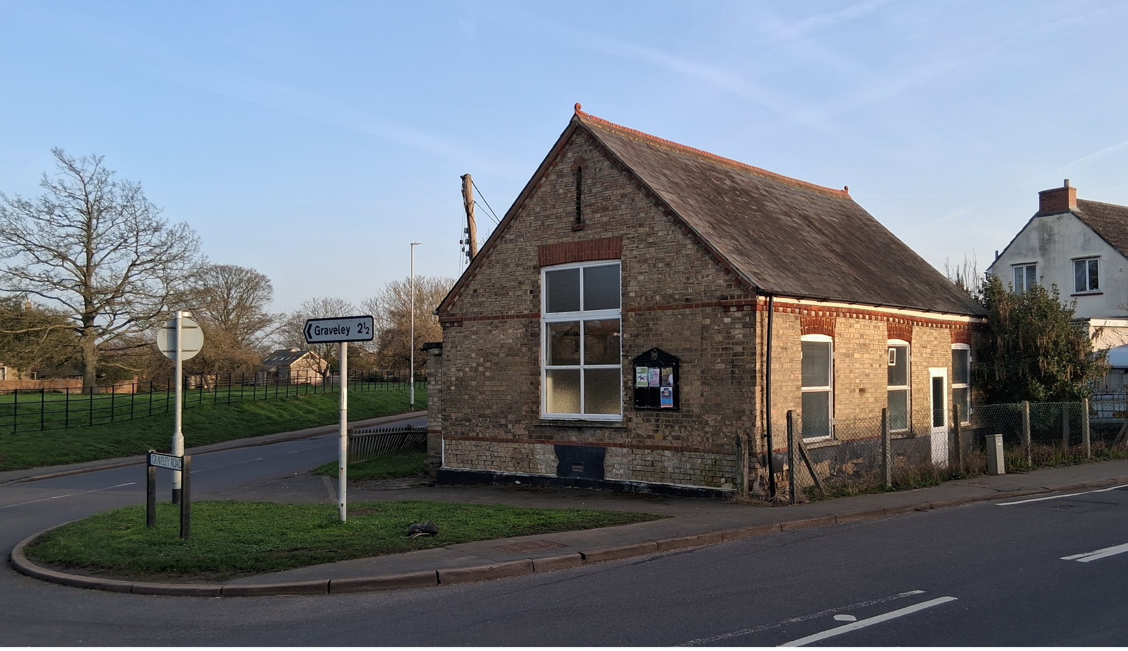
The Former Church Rooms, Graveley Road Offord D'Arcy, St Neots, PE19 5RB