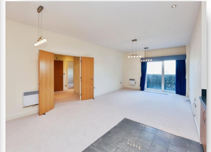
Jacana Court, Rope Quays, Gosport PO12 1EN