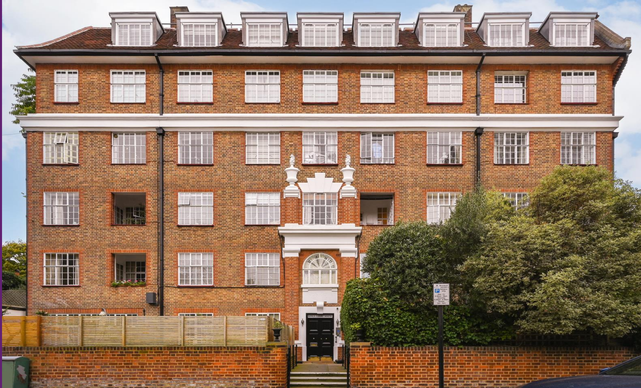
Kings Court South Chelsea Manor Gardens, SW3