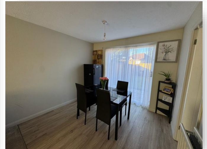
Alexander Way, Dereham NR19 2SW