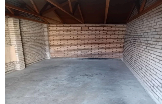
Property Image 6 - Back page