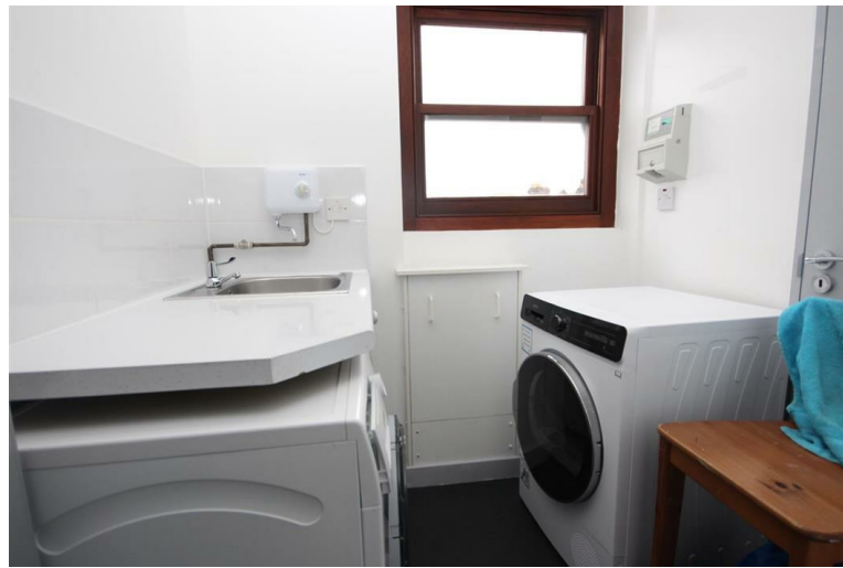
SECOND FLOOR 82 sq.ft. (7.6 sq.m.) approx.