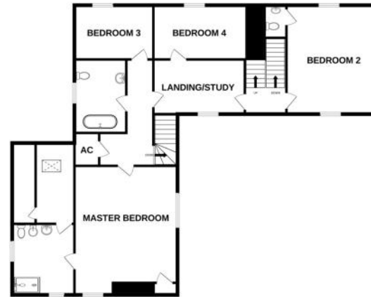
1ST FLOOR 1501 sq.ft. (139.4 sq.m.) approx.