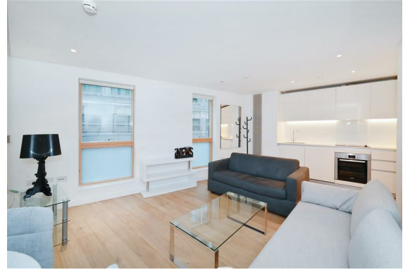
Merchant Square Approx. Gross Internal Area 914 Sq Ft - 84.91 Sq M