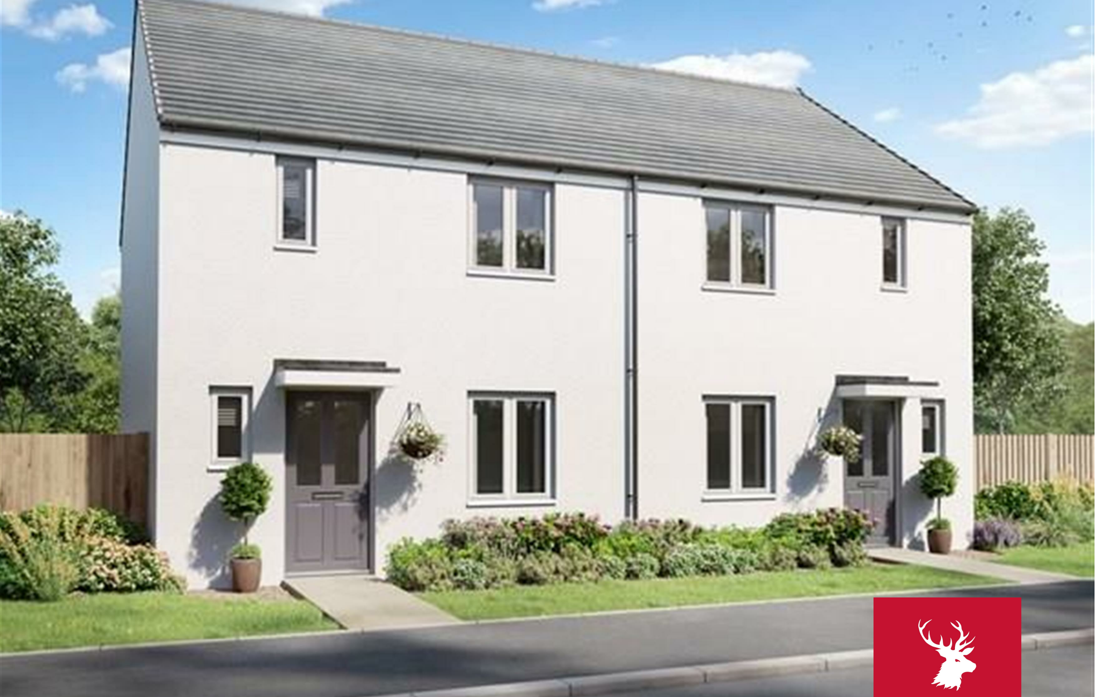
The Danbury, Plot 90