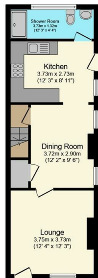
Ground Floor Floor area 44.1 sq.m. (475 sq.ft.)