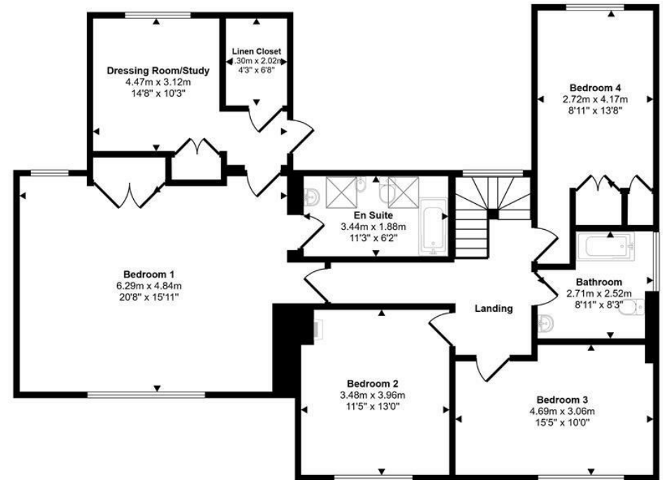
First Floor Approx 120 sq m / 1287 sq ft

This floorplan is only for illustrative purposes and is not to scale. Measurements of rooms, doors, windows, and any items are approximate and no responsibility is taken for any error, omission or mis-statement. Icons of items such as bathroom suites are representations only and may not look like the real items. Made with Made Snappy 360.