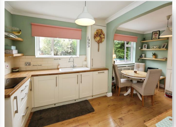
Beauchamp Avenue, GOSPORT PO13 0LQ