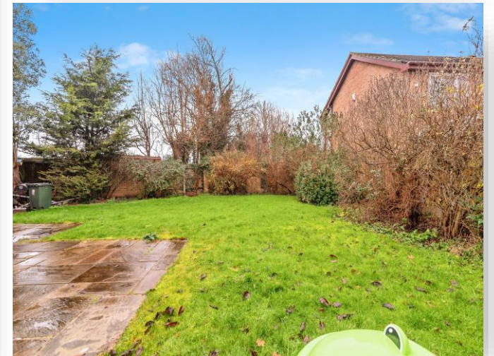
Acorn Bank, West Bridgford Nottingham NG2 7SH