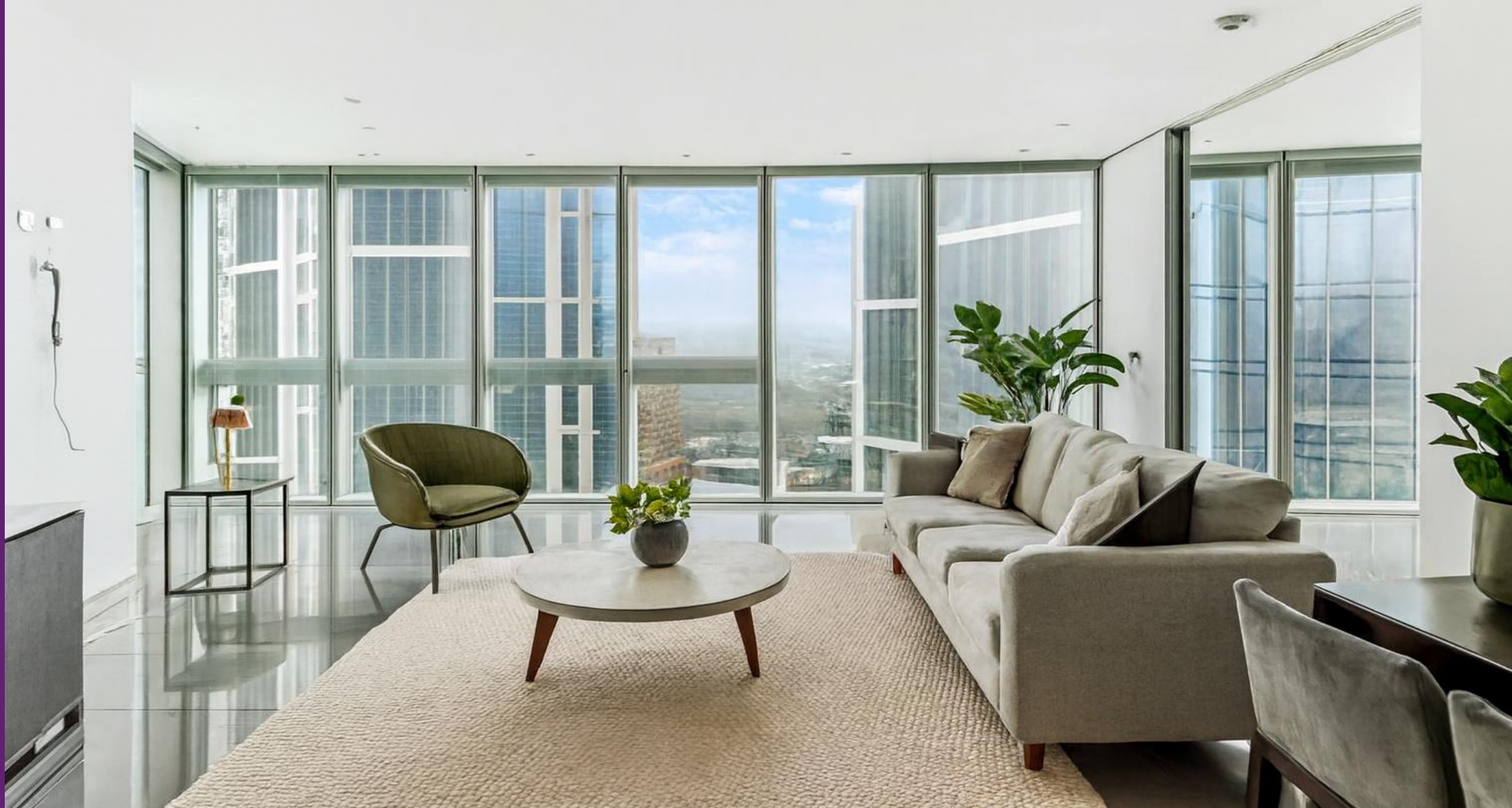
The Tower 1 St George Wharf, SW8