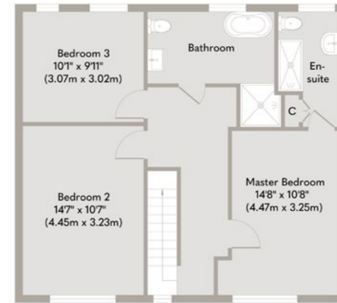
First Floor Approximate Floor Area 694 sq. ft (64.47 sq. m)