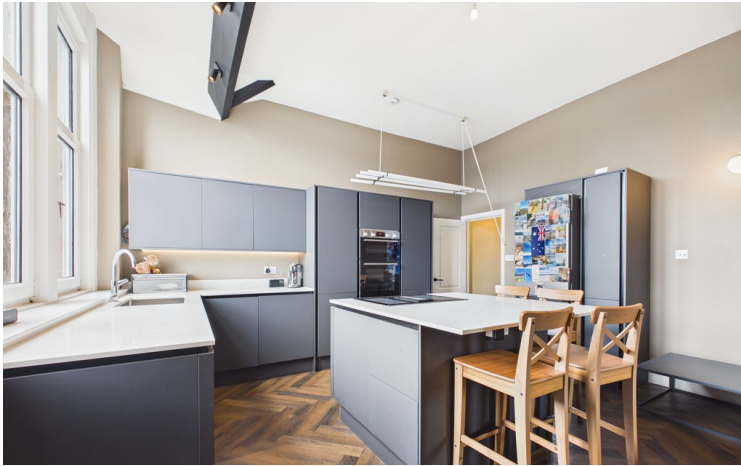
Open Plan Living / Dining Room / Kitchen