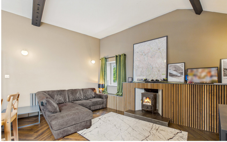
Open Plan Living / Dining Room / Kitchen