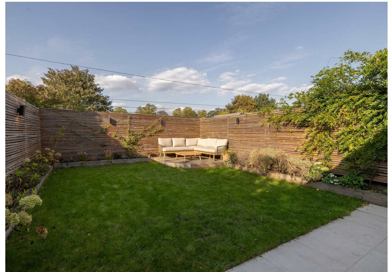
Garden 20'0" x 28'2"