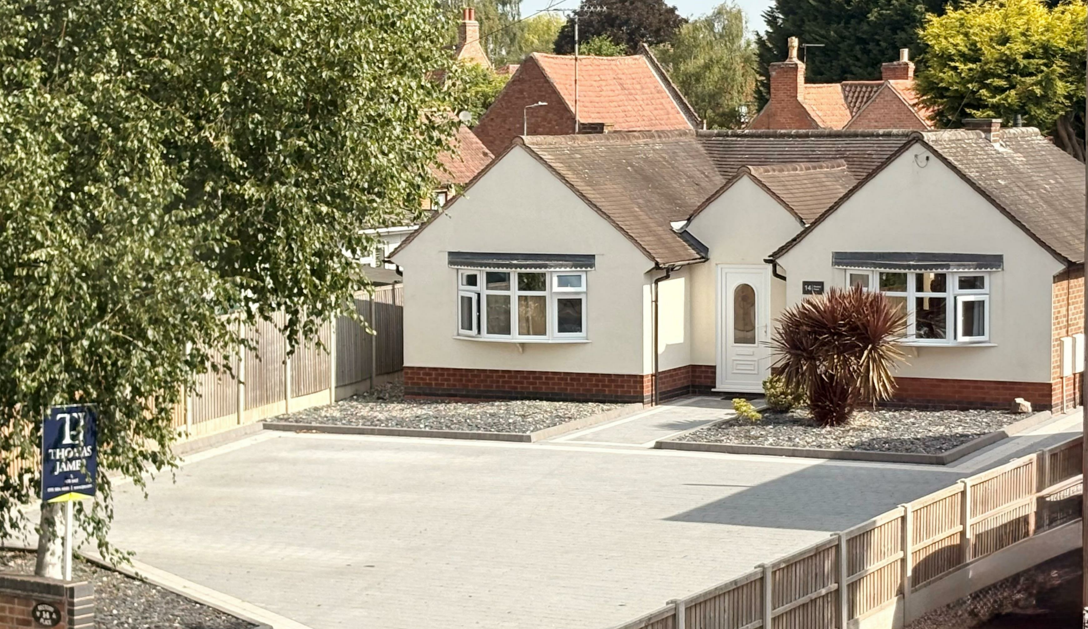
14 Rectory Place, Barton In Fabis, NG11 0AL