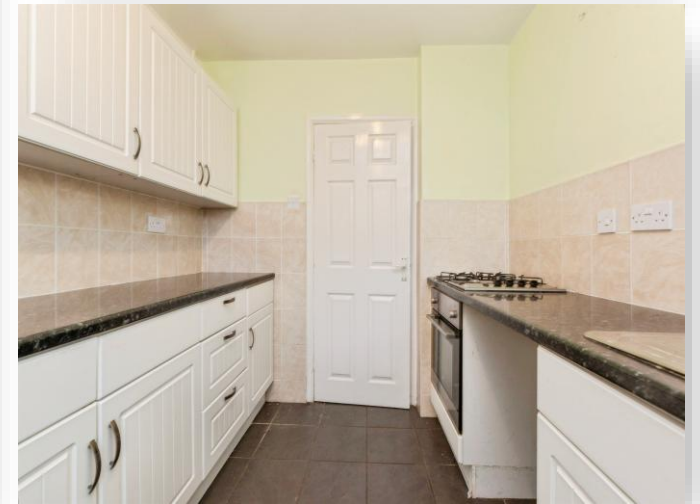
Orwell Walk, Hartlepool, TS25 4JD