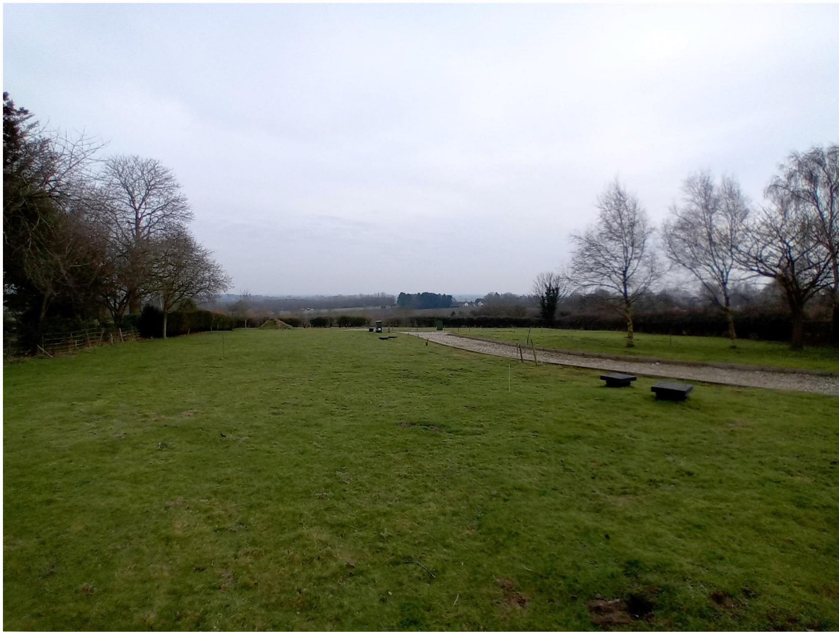
Land Main Road, Toynton All Saints Spilsby PE23 5AE