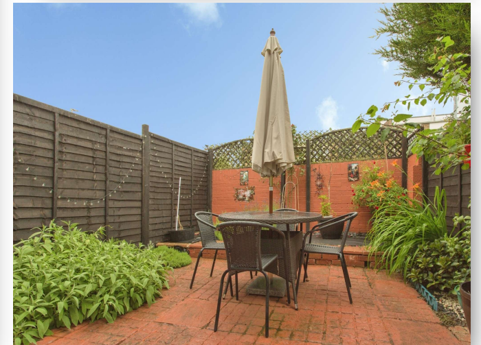
5 Otter Gardens, Bar Hill, Cambridge, CB23 8ED